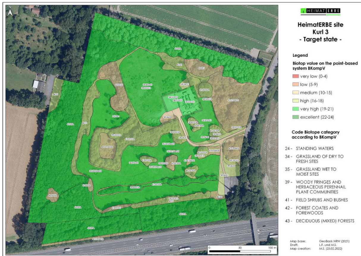
Fig. 4. Example of biotope mapping based on the point-based system BKompV of the target state of the ecological restoration for Kurl 3.

benefits, as the renaturation measures including biotope development with positive impacts on the ecosystems take place in a long-term perspective and mainly after the environmental burdens took place. On the monetary basis, the compensation can take place immediately, but from an ecosystem perspective, interim losses occur caused by long biotope development times until the full maturity of the targeted biotopes and ecosystems.