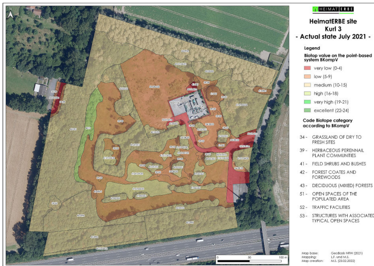
Fig. 3. Example of biotope mapping based on the point-based system BKompV as the starting point for the ecological restoration for Kurl 3.

climate targets are formulated mainly on country, sector or organization level (BMU, 2019; European Commission, 2021; Giesekam et al., 2021; SBTi, 2022b; UNFCCC, 2015) but not on product level. As CEC aims to compensate the environmental impacts also of products or individuals, there is no clear guidance on how reduction targets should be set. Furthermore, the reduction targets are exclusively available for climate change and are missing for all other impact categories. There is also the need to define how to deal with trade-offs between impact categories, e. g., when the impacts are reduced significantly in the majority of analysed impact categories, but not in all. Thus, further research should focus on how to define reduction targets on a product and individual level, how to define reduction targets for a broad set of impact categories and how to deal with trade-offs between impact categories in CEC.